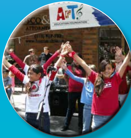
Burbank Arts for All Foundation – supporting arts education in the Burbank Unified School District