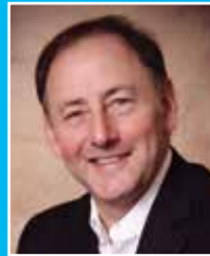
Arye Gross Actor