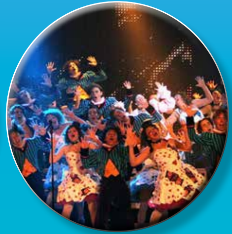
John Burroughs HS Vocal Music Association – America's premier high school vocal music program

Help support the future of our youth in perpetuity through a permanent contribution to any of these funds today!