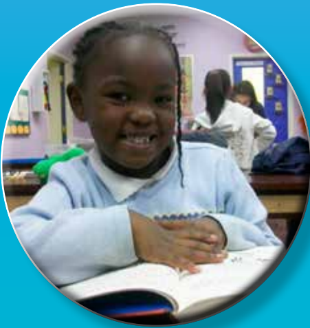
Boys and Girls Club of Burbank/ Greater East Valley – programs from sports to arts to tutoring and mentorship

We are proud to manage Agency Endowment Funds for the following nonprofits: